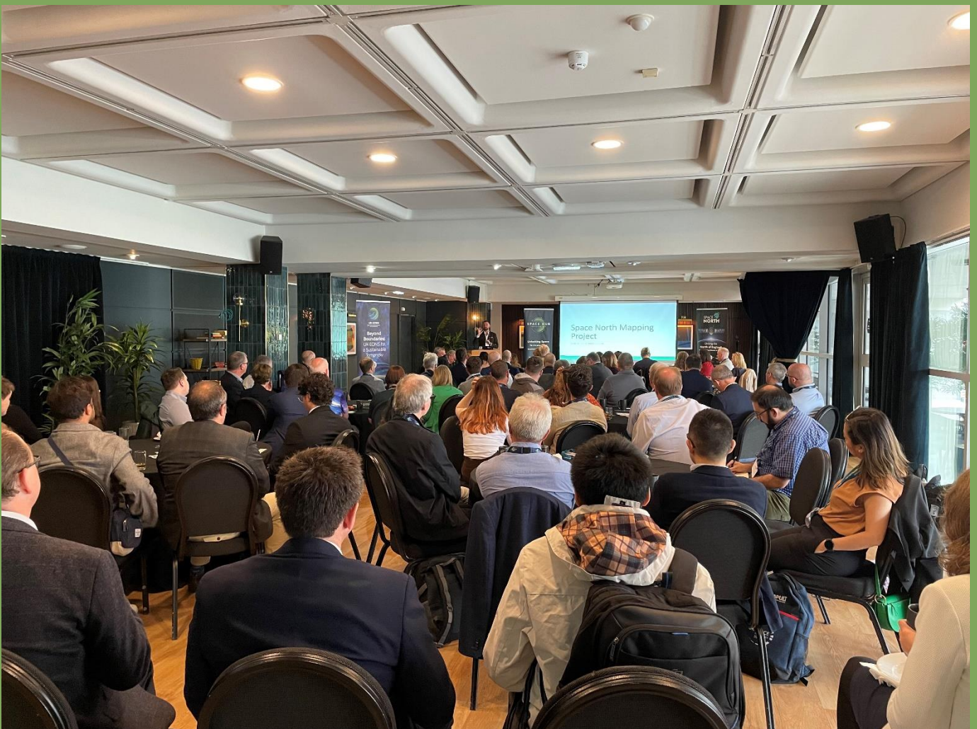
Figure 5: Space North Welcome