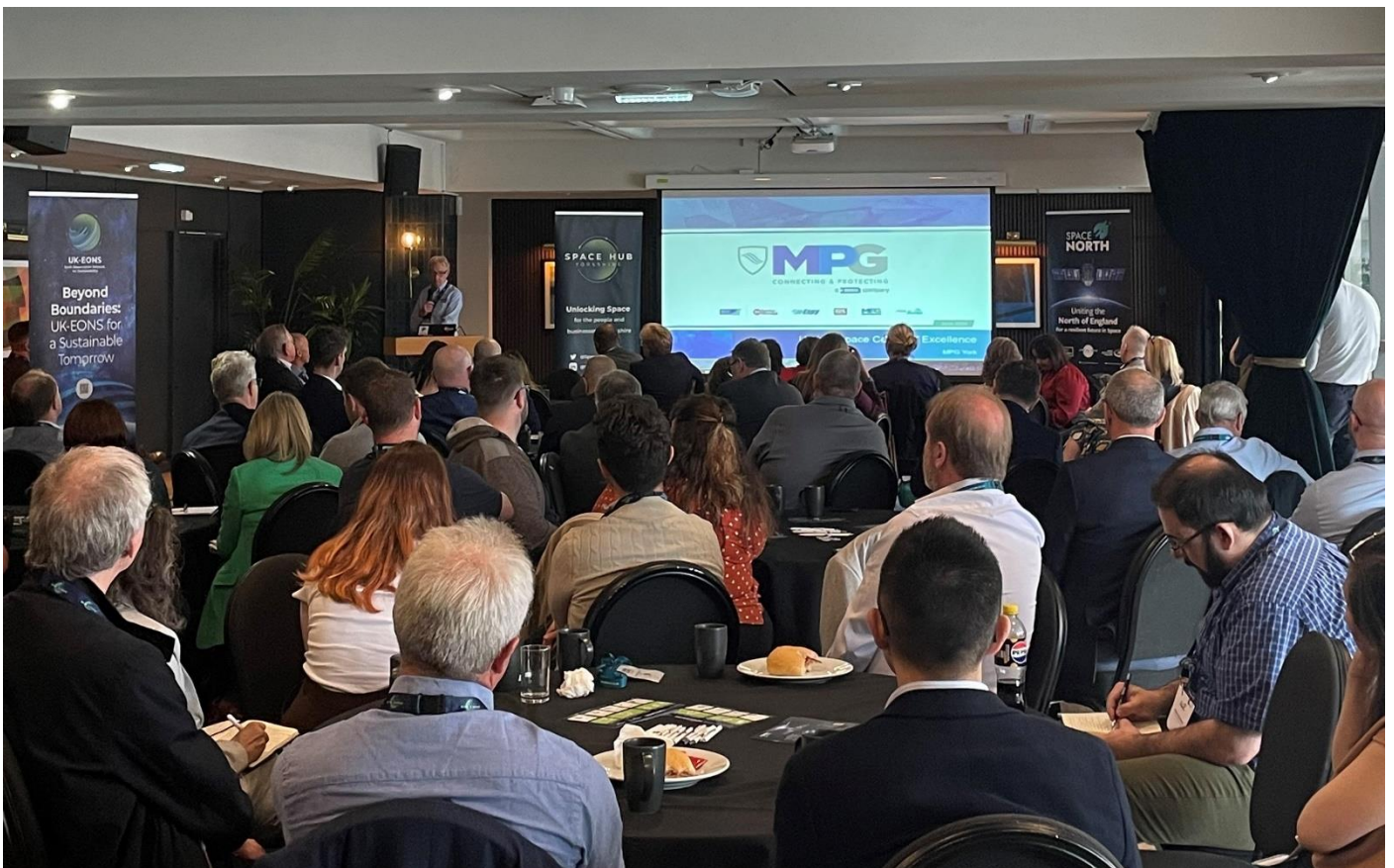
Figure 4: MPG Presentation

Attendees made new connections at this event.