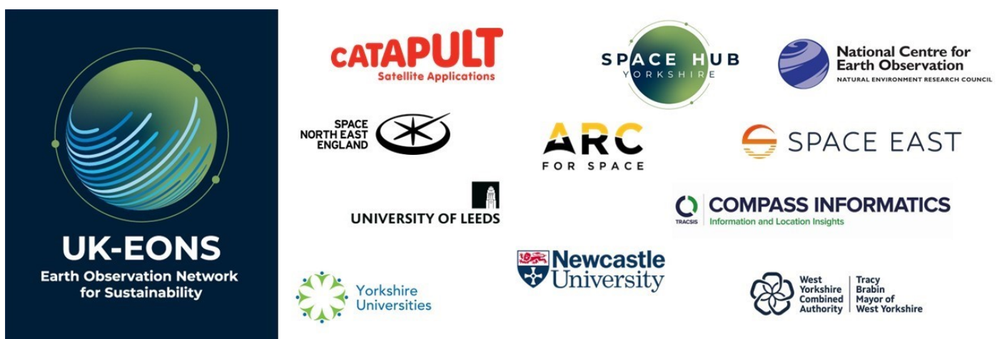
Figure 1: UK-EONS delivery partners

The launch event was hosted and organised by Space Hub Yorkshire and UK-EONS with support from the Satellite Applications Catapult.